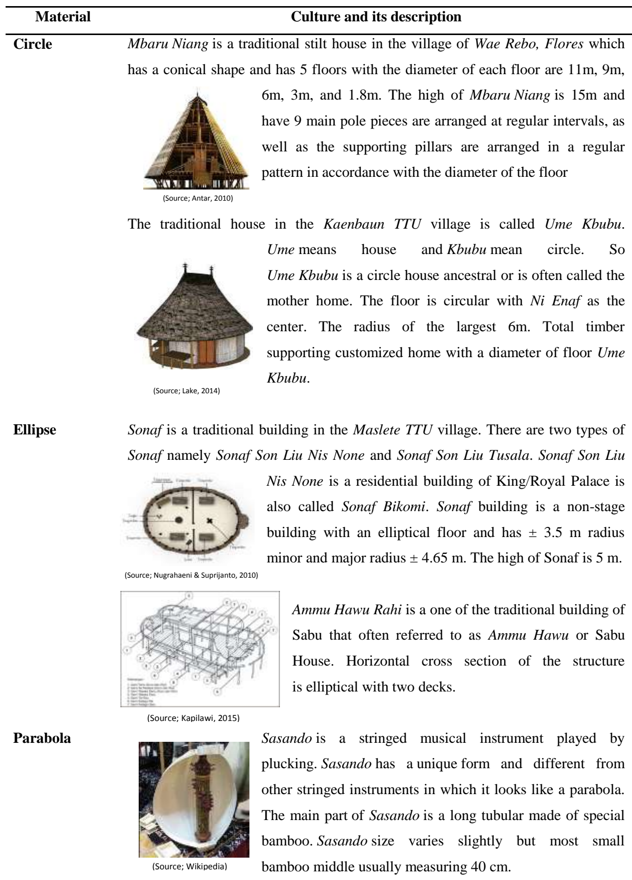
Table 1. Mathematics aspects and culture