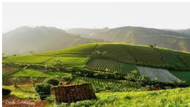
Figure 1. Panyaweuyan Hill, Majalengka

The culture of Panyaweuyan -hill terraces in the city of Majalengka is a form of relationship between mathematics and local culture. Mathematical and cultural integration means contextual and realistic mathematics, (Supiyati, 2019). Panyaweuyan-terraces or swales are buildings for soil and water conservation which are mechanically made to reduce the slope of the slopes or reduce the length of the slopes by digging or filling the land across the slope (Sukartaatmadja, 2004) which is made in steps like terraces made parallel to natural contours. Terraces in general resemble a hill with steps transversely. It is not widely known that terraced forms have a close relationship with the concept of arithmetic sequences and sequences. The following is the terraced land of Panyaweuyan-hills in Majalengka Regency.